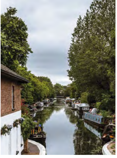
Clockwise from top: Portobello Road; Little Venice; Harrods; The Serpentine lake in Hyde Park

former home, to see her gorgeous gowns in Diana: Her Fashion Story (to 28 Feb 2018). If that inspires your stylish side, stroll along Kensington High Street , a major shopping hub. Pit stop: Verdi Italian Kitchen, in the Royal Albert Hall, for afternoon tea.