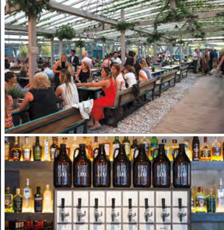
Clockwise from above: Crave Market; Pergola Paddington; Heist Bank Inset: Rolling Bridge