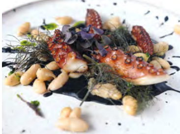
Clockwise from top of page:. The Waterway, Buchanans Cheesemonger; polpo arrosto at Stuzzico; Royal Lancaster London's Halloween afternoon tea