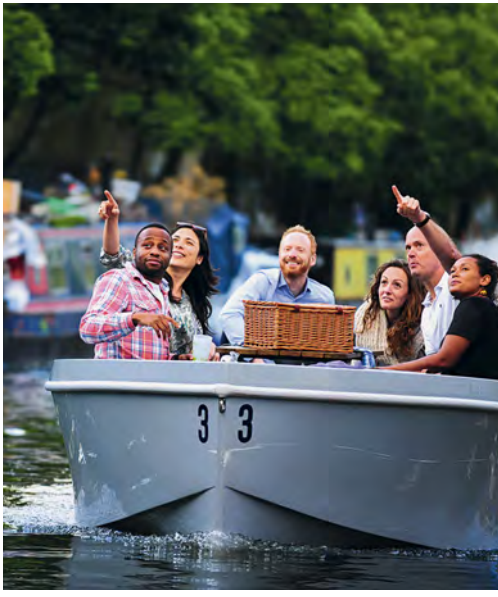
Clockwise from top left: Fan Bridge; paddleboard with Active360; cruise in style with GoBoat; oysters aboard The Grand Duchess; canoe for two

Start your day by watching kids as they joyously dart between fountains in Paddington Basin. Merchant Square Water Maze's 320 water jets form concentric circles that vary from gentle bubbles to shoulder-height sensations.