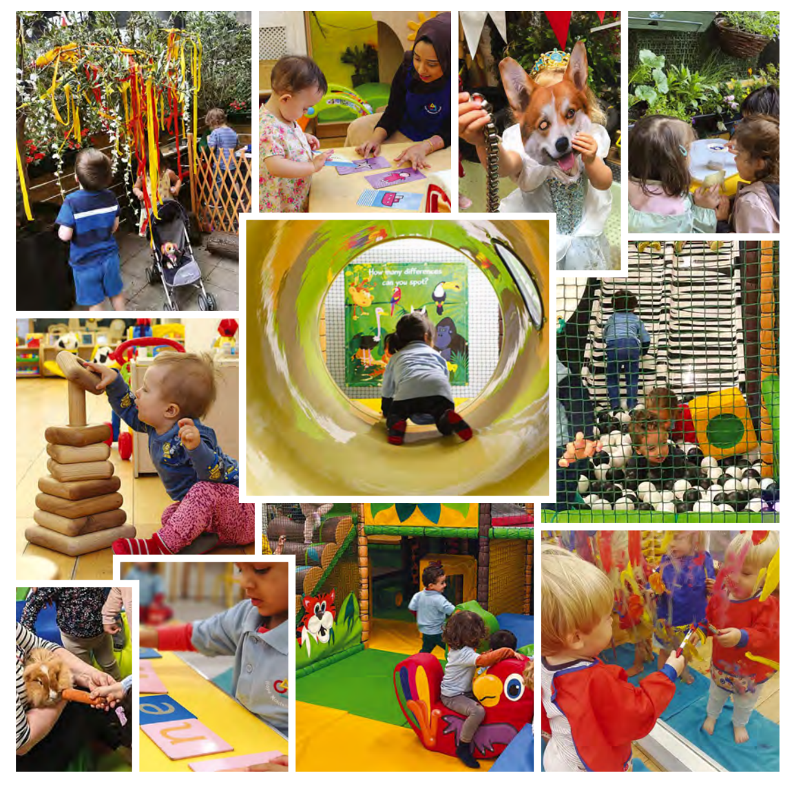
Supporting our local community for 15 years

admin@hopemontessorischool.com +44 7919 844853 www.hopemontessorischool.com